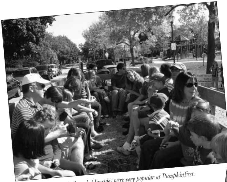
Improv Playhouse's Hayrides were very popular at PumpkinFest.