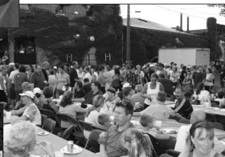
Twilight Shuffle participants enjoy pizza and "hydration" at the post-race party in the back lot of Mickey Finn's.