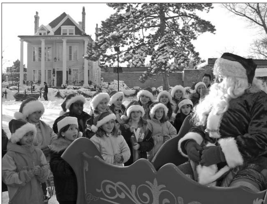
Dancecenter North's Soundsations sing carols to Santa Claus in Cook Park.

After the holiday tea, guests can walk next door to the Libertyville Civic Center to enjoy the children's Holiday Shoppe, where children can shop a wide array of reasonably-priced gifts with the help of Santa's elves. Holiday Shoppe hours are 11:00am to 4:00pm, and every youngster is welcome. (Parents: KEEP OUT!)