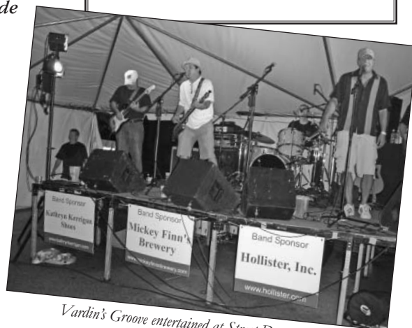
Vardin's Groove entertained at Street Dance 2008

Saturday, February 21 1pm - 5pm Downtown Libertyville