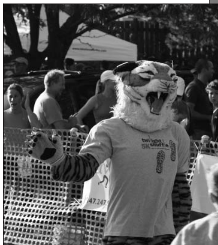
Willie the Wildcat, celebrity race starter, mingles with the crowd prior to the race.