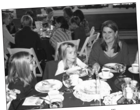
The Kraft Girls enjoy the Victorian Tea.

Stroll through downtown Libertyville and enjoy the many wonderful businesses that fill our downtown with cheer and pleasurable shopping opportunities. Store owners and their cheerful employees are eager to help you complete your holiday shopping without leaving town.