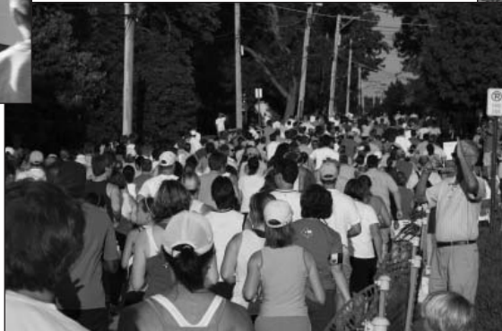
No, it's not the Chicago Marathon. It's the Twilight Shuffle!