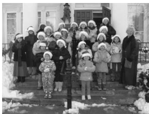
Dancecenter North's Soundsations sing carols from the Cook Mansion steps.