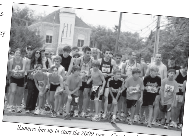
Runners line up to start the 2009 race

You don't have to be a runner to have fun at the Twilight Shuffle!