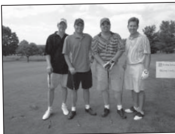
Golf Outing 2009