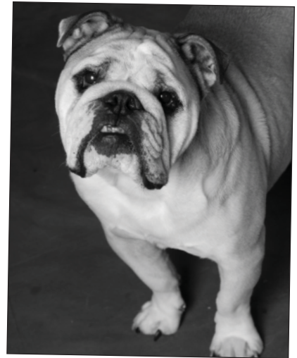
Dog Days – Courtesy of Studio West

The downtown merchants are clearing their racks to make room for the fall season merchandise. You might find the best bargains around!