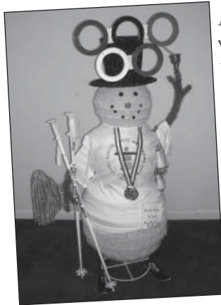
First Place: Butterfield School

During the month of February, twelve snowmen graced the entrances of various storefronts each week to celebrate the inaugural Snowmen on Parade event. Local schools and civic groups embraced the challenge to see who could garner the most votes for a prize of $500 to the winning designers. Snowmen included a 50 year old lady skater to a Valentine "cutie," and everything in between. Design groups included St. John's School, Libertyville High School Art Club, Adler School, Libertyville Junior Women's Club, Oak Grove Junior High School, Highland Middle School, Rockland School, Libertyville High School Girls Lacrosse team, Copeland School, St. Joseph's School, Butterfield School and David Adler Cultural Center.