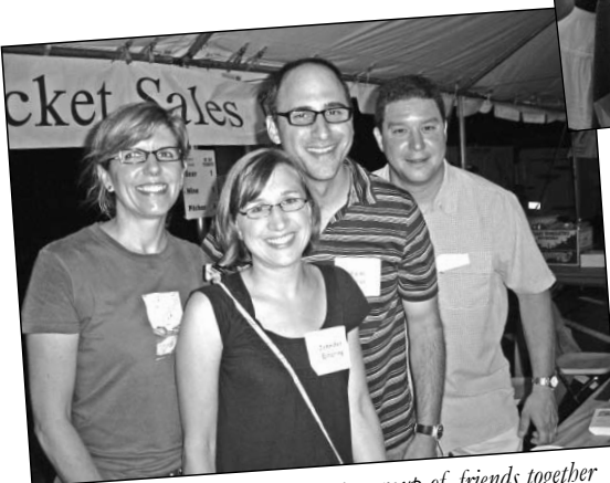
It's even more fun when you get a group of friends together to help at Street Dance!