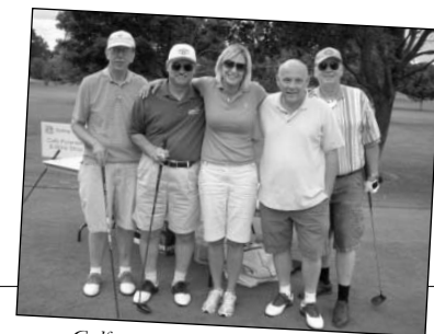
Golfers at the wine tasting held at the Café Pyrenees sponsored hole.

By the end of the evening, many golfers were already making plans to sign up for next year's outing. Be sure to save the date: Monday, June 28, 2010, and watch for details or call the MSL office with your e-mail address to get early reservation information.