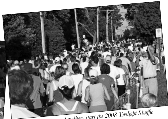
729 runners and walkers start the 2008 Twilight Shuffle

INSIDE... TWILIGHT SHUFFLE & STREET DANCE