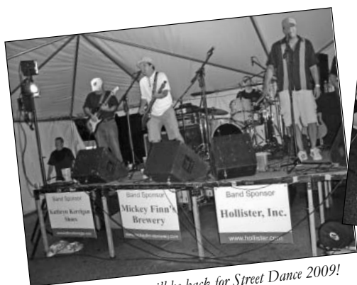
Vardin's Groove will be back for Street Dance 2009!

One last reminder: SAVE THE DATE AND THE BABYSITTER AND WE'LL SEE YOU ON SEPTEMBER 26 TH !