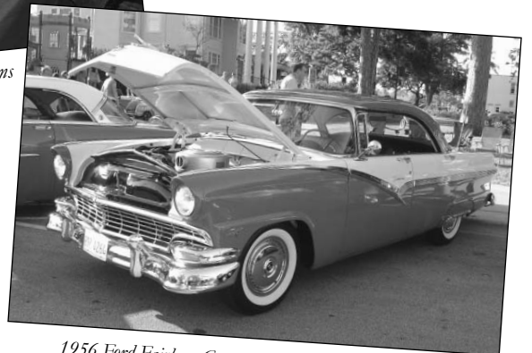
1956 Ford Fairlane Crown Victoria at Car Fun on 21.