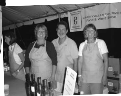
Parkview Gourmet will once again be serving wine at Street Dance 2009