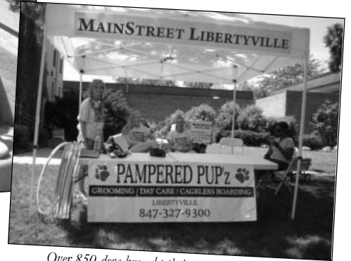
Over 850 dogs brought their owners downtown to Dog Days of Summer