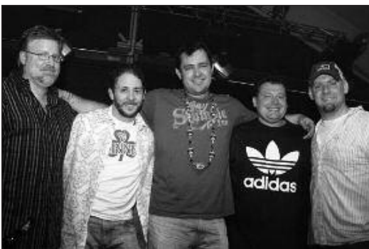
Betty Soul Band