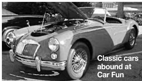
Classic cars abound at Car Fun

Start out the evening at one of Libertyville's diverse restaurants – from subs to steak to salads, al fresco or air conditioned...you choose! Then head down the "street" where local shops offer music, wine tastings, special discounts, or glimpses of local artists at work. A great way to celebrate "TGIF!"